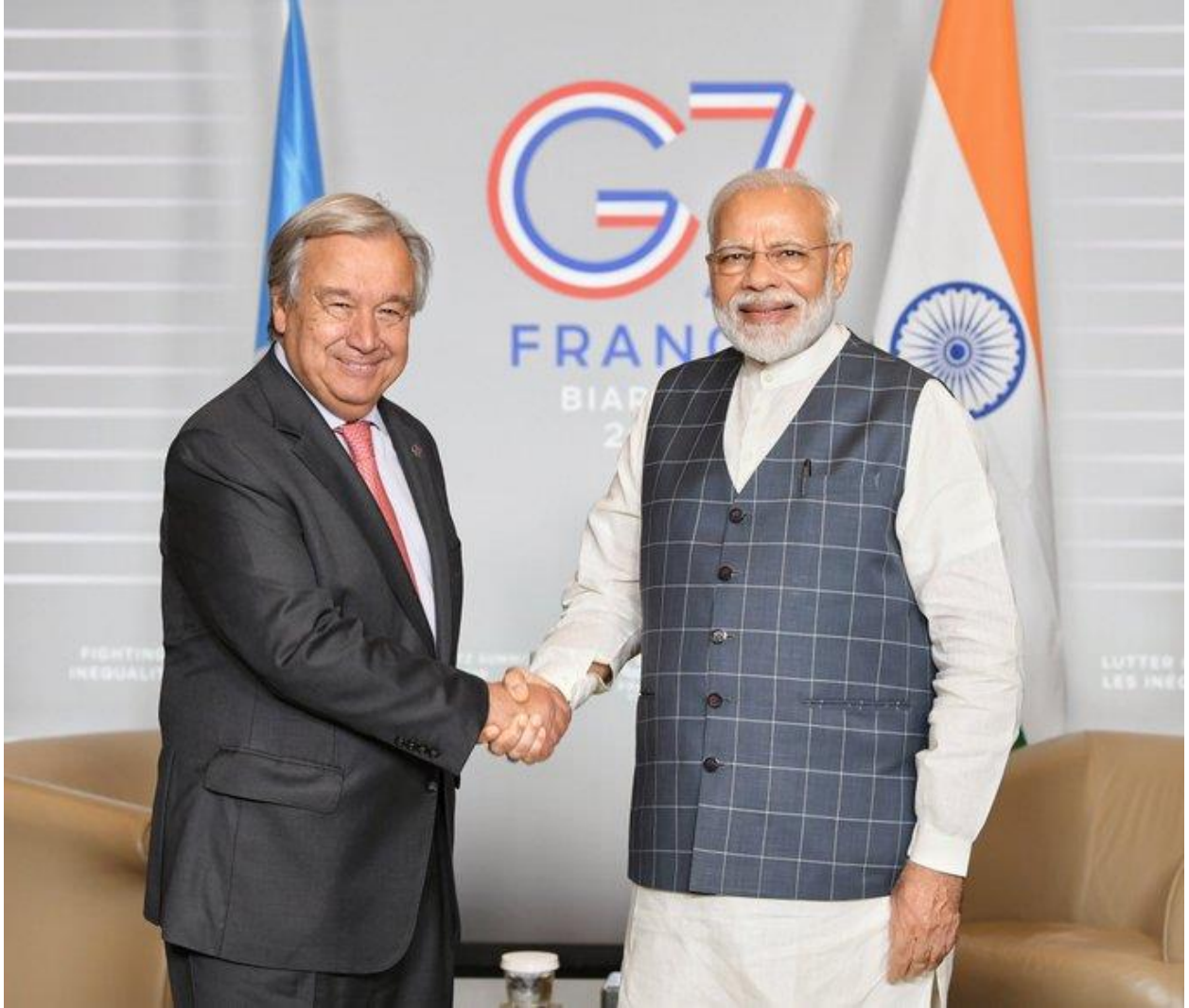
UN Secretary General meeting Prime Minister Narendra Modi on the sidelines of the 45 th G7 Summit in Biarritz, France in August 2019.